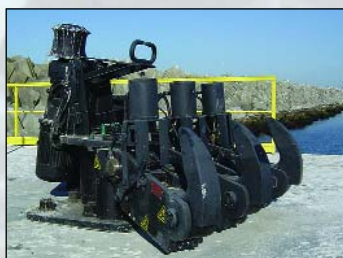
Quick Release Mooring Hooks