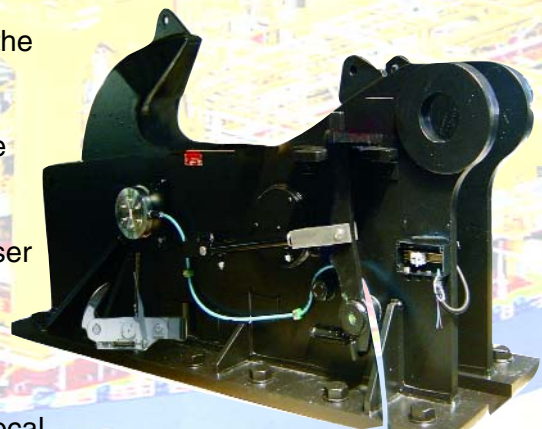
650 ton Heavy Duty Offshore Hook

In case of emergency the hook can be released manually by means of release lever, Hydraulically via Local control panel of the Hydraulic Power-pack or via the control Panel in the Remote Control Room / Bridge.