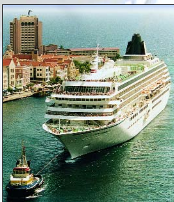
Quick Release Towing Hooks