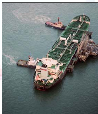
Berthing Approach System