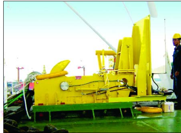
FSO Hook 250 ton